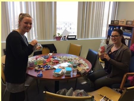
Student interns putting together holiday gifts for consumers