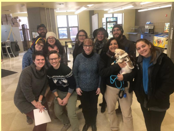
Volunteers were all smiles as they posed for a quick picture before heading out to deliver Thanksgiving Meals

We are happy to announce that HESSCO will host a new counselor training in our Sharon office on Fridays starting on February 15th through May 10th. Training runs from 10 am - 2 pm each Friday with April 19th off. Please email dfradkin@hessco.org for more information.